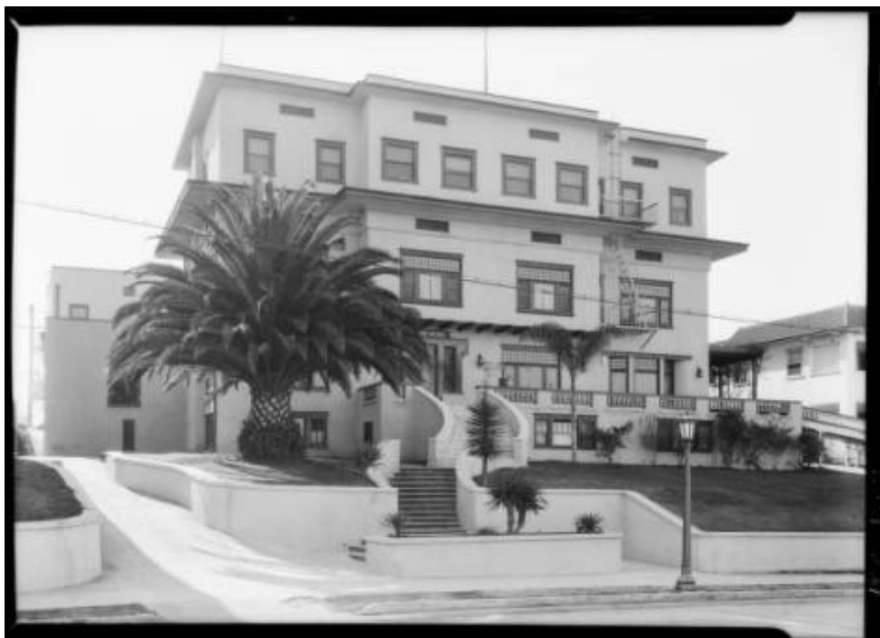
The Barker Hotel since demolished