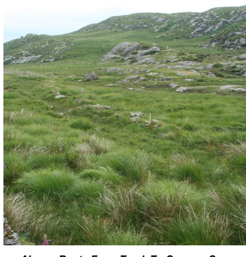
Above: Route From Track To Conway Crag

afternoon tea. Around 35-40 minutes walking and steep uphill for the first part.