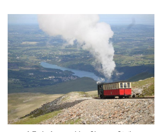
A Train Approaching Clogwyn Station